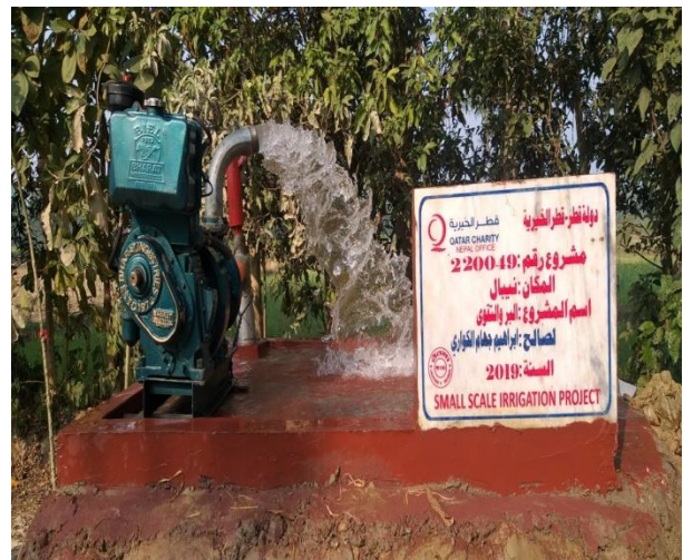
irrigation support Facility To Needy and

Chetana Malangwa implemented the Project Small Scale Irrigation Support to Farmers in Sarlahi district on 5 th December 2019. The project was funded by Qatar charity Nepal. The main objective of the project was to Increase farm household incomes and food security reducing dependency on rain fed agriculture & Improve crop production and livestock health of smallholder farmers by irrigation support Facility To Needy and marginalized People at sarlahi district. The Project installed 7 Shallow Irrigation Pumps of at Least 30 Meters depth Needy Farmers In Coordination with QC Nepal. The Irrigation were installed at 7 Different Location Of Sarlahi District. It Was Installed At 4 Irrigation Pump Support in Malangwa Municipalities, 2 Irrigation Pump Support in Haripurwa Municipality & 1 Irrigation Pump Support in Brahampuri Rural Municipality Of Sarlahi district. As The Main Motive of Project Was to Cover Poor, needy ,Vulnerable and